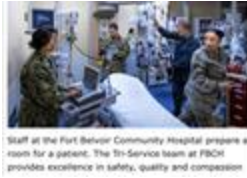
Staff at the Fort Belvoir Community Hospital presents a room for a patient. The Tri-Service team at FBCOH provides excellence in safety, quality and compassion