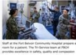
Staff at the Fort Belvoir Community Hospital prepare a room for a patient. The Tri-Service team at FBCOH provides excellence in safety, quality and compassion.